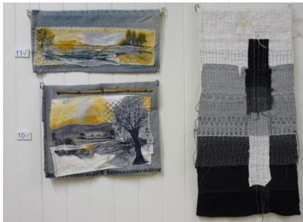
Photo shows three works by Wendy Sargent. Other work by Wendy will be shown at Knox Church.)